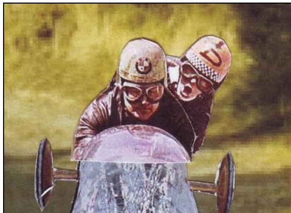
Both are wearing old-fashioned crash helmets. They are laughing and having a great time.

Music under: Faster, livelier Mediterranean folk music