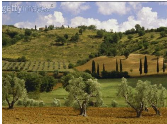
Open on brief establishing shot of a beautiful Mediterranean landscape on a hot and sunny day, with hills and olive groves in view.

Music under: Mediterranean folk music (not too lively at this point)