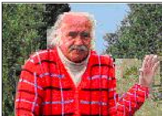
The man acknowledges her with a wave, but does not stop.