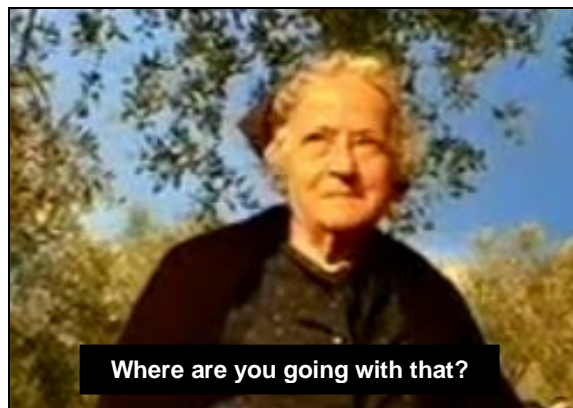
The woman shouts out to him in Italian and a translation of her words appears as a super.