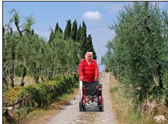
Cut to an elderly man walking with some urgency along a rough track past one of the olive groves. He is pushing along an empty wheelchair.

Music under: Mediterranean folk music (not too lively at this point)