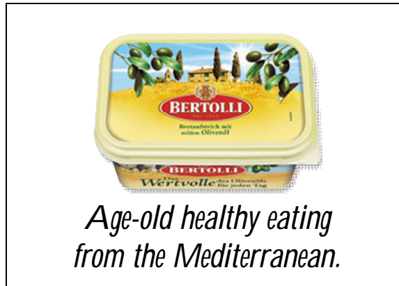
Cut to Bertolli pack shot.