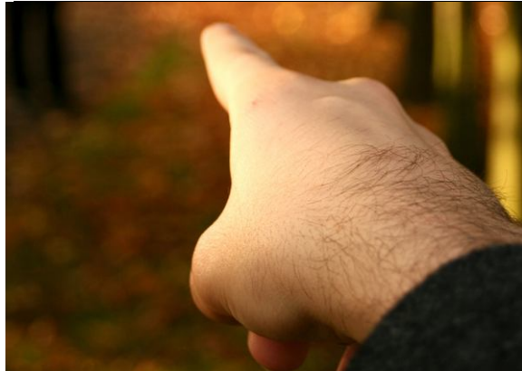
This alarms the other three women even more, but then the woman laying the table points in the direction of a large slope.