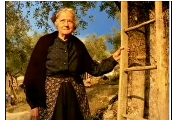
In the olive grove he is passing, an elderly woman is up a ladder picking olives from a tree. She notices the man pushing the empty wheelchair, and (since she evidently knows him) calls out and gives him a wave.