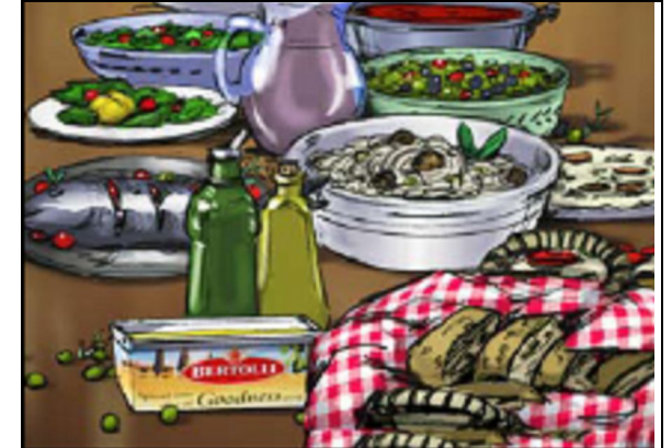
VO: And of Bertolli spread.