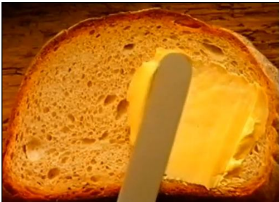
Cut to a knife spreading Bertolli onto a slice of bread.