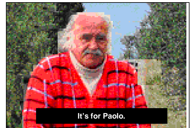
The man calls back, and his translated words appear as a super.