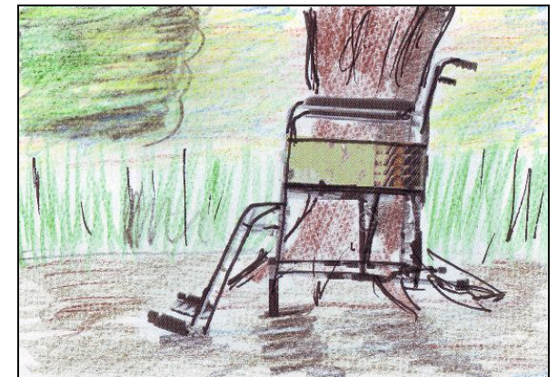
To make this even clearer, we may insert a brief shot of the wheelchair now without its wheels.