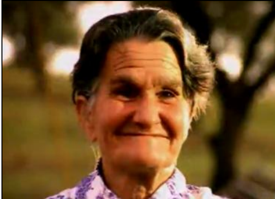
The three visiting women smile with relief as they realise they have got the wrong end of the stick. The woman setting the table invites them to sit down.