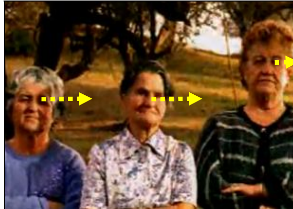
The three visitors turn to look...